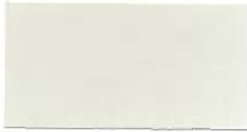
30 WHITE = 01