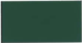
LEAF GREEN = 14 ♦