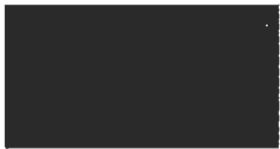
MUSKET BROWN = 04 ♦