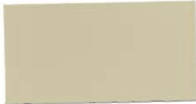
RAFFIA BEIGE = 12 ♦