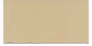
IVORY = 11