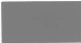
OLD TOWN GRAY = 06 ♦