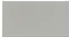
COLONIAL GRAY = 46 ♦