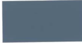
GS BLUE = 08 ♦